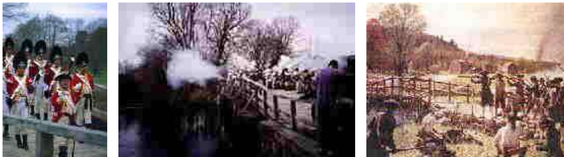
Battle at the North Bridge in Concord

Although it is known that no British soldiers were killed at Lexington Green , Major Pitcairn's horse was shot twice. Some sources say that Pitcairn, who was 52 and portly, fell off and that because of this event his pistols were lost and are now, together with a charming miniature of him, at Hancock-Clarke House, 36 Hancock Street, Lexington Mass. (617-861-0928), as treasured relics of April 19, 1775. Other sources confirm that the horse was wounded at the Battle in Lexington but that on the march back to Lexington, his horse (the same?) , frightened by a sudden volley, threw him off and escaped, obliging him to continue on foot.